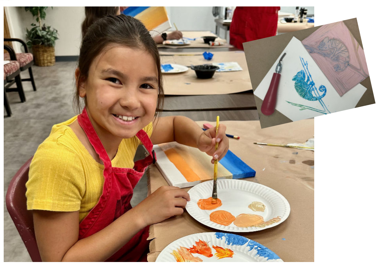
Painting, Printmaking and More!

This class will teach the building blocks used by artists to create works of art through painting with acrylics and printmaking. Students will explore and learn techniques such as light, form, color wheel concepts, perspective, texture and composition.